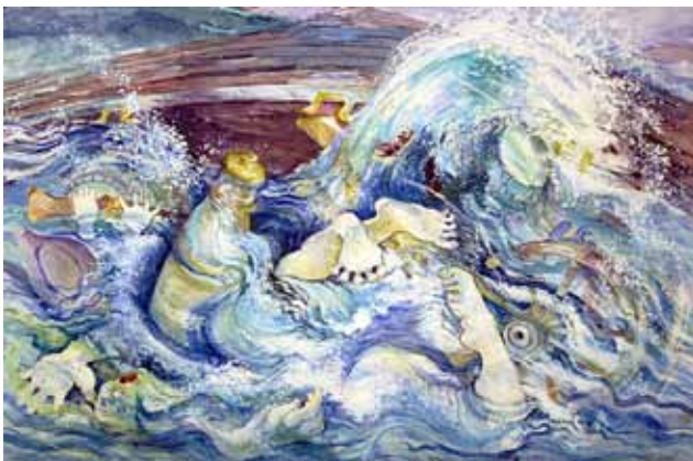
9 Capsized 76 x 96.5 £1100