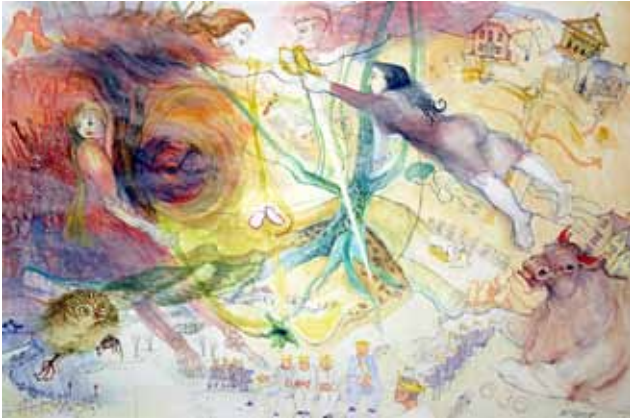
11 Apocalypse 70 x 90 £1400