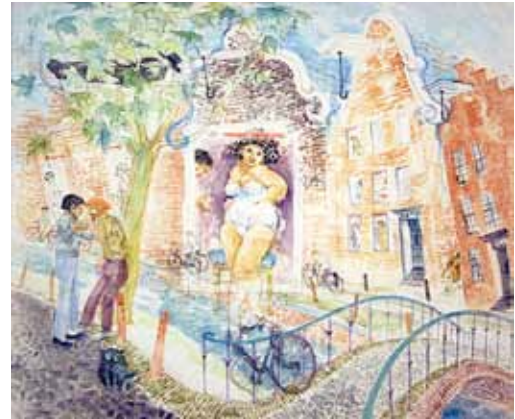
8 Saving a Jew, Amsterdam 53.3 x 61 £700