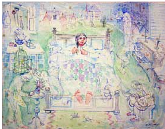
2 Mrs Ogmores Pritchard (Under Milk Wood) 52 x 58 £500