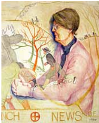
19 Betty, the embroiderer 78.5 x 68.5 £850