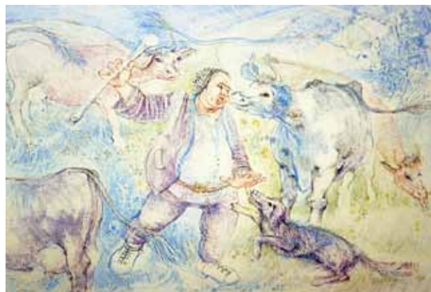
4 Farmer Uta Watkins (Under Milk Wood) 76 x 96.5 £1100