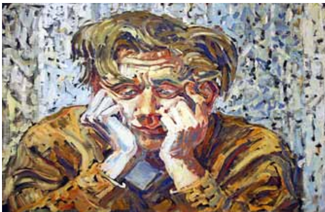
21 Fed up! 81 x 100 NFS