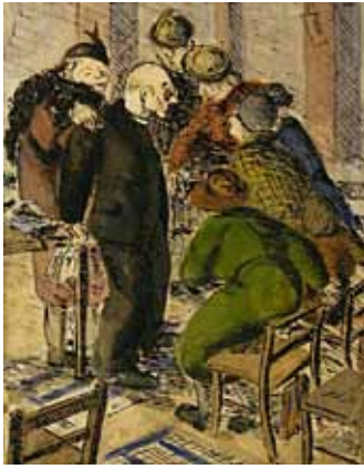
29 The Speaker 45 x 38 NFS