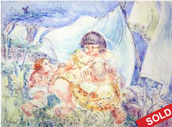
7 Polly Garter (Under Milk Wood) 58 x 69 £500