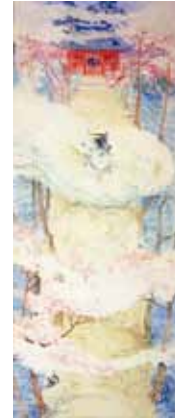
24 Shrine, Shino Bazu Pond, Ueno, Tokyo 91.5 x 48 NFS