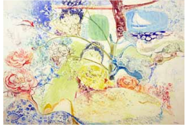
18 A garden by the sea 84 x 99 £1200