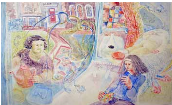
15 Leinster Square 91.5 x 116.5 £1500