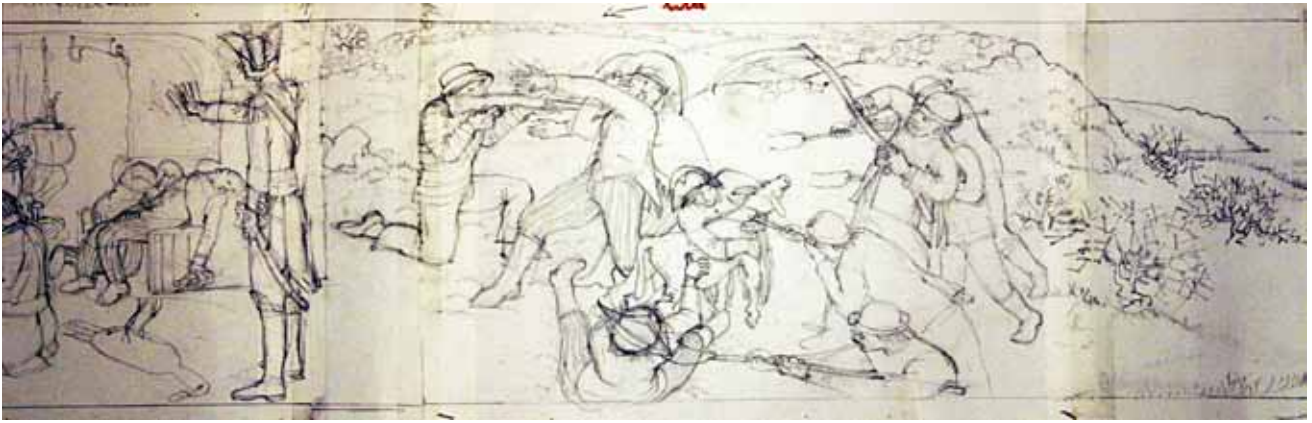
These are details from the 14-foot first design for the Fishguard Invasion Tapestry