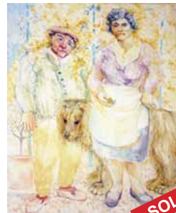
10 Untitled 63.5 x 53.3 £500