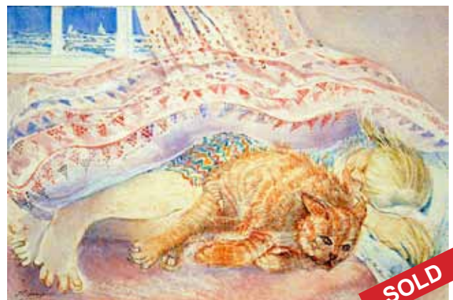
16 Curled up 45.5 x 55.5 £300