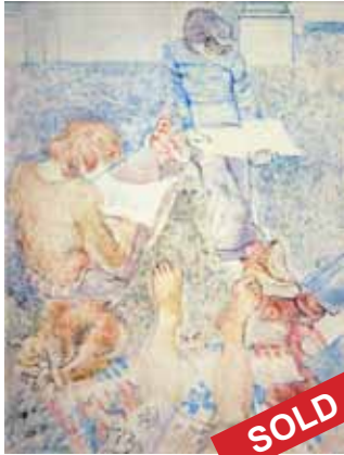
17 Family relaxing 61 x 52 £400