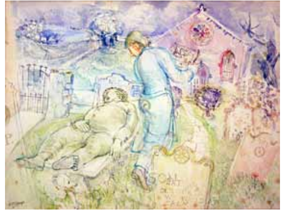
6 Cherry Owen resting on a tombstone (Under Milk Wood) 53 x 61.5 £500