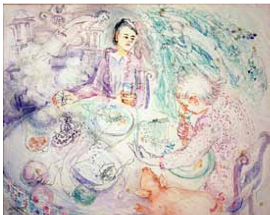
3 Mr and Mrs Pugh at table (Under Milk Wood) 54.5 x 61 £500