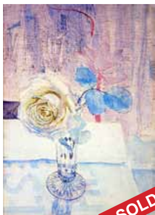
27 Paul's lemon pillar 68.5 x 44.5 £225