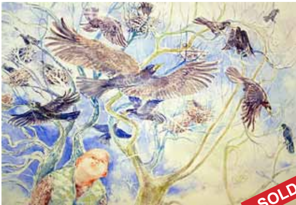
13 Rookery 83.5 x 104 £1000