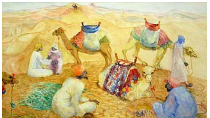
22 Giza 45.5 x 66 £400