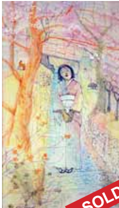
25 Kyoto 57 x 39.5 £300