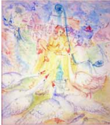
5 Gabbing around the pump (Under Milk Wood) 61 x 56 £500