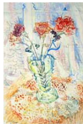
28 Flower piece 58.5 x 45.5 £225