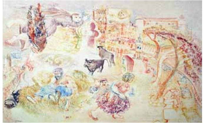
12 Saints Teresa and John Avila, Spain 85 x 109 £1500