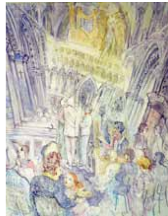
14 Fishguard Music Festival, before a concert 106.5 x 100 £1400