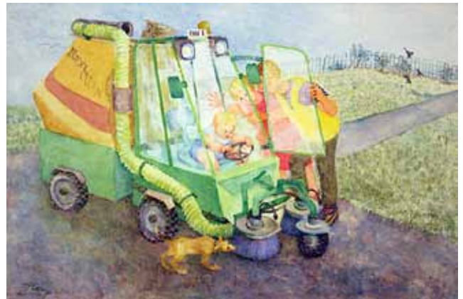
20 Sweeper machine 47 x 61 £300