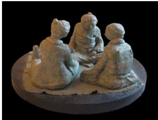
A model of a picnic in Kyoto

The work may be purchased on an interest-free scheme. Please contact the Gallery Manager, Lynne Crompton.