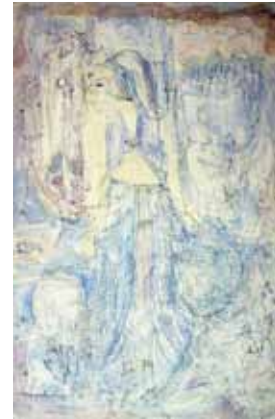
26 Belly dancer, Istanbul 104 x 81 £1,300